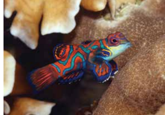
Mandarin Dragonet

Back at Sam's is one more highlight. As the sun sinks low in the sky, mandarin dragonets can be spotted on the wall that descends from the restaurant. What a treat to have one of these elusive beauties emerge from hiding with its long dorsal fin billowing brilliant blue and orange like a flowing silk gown. We would love to stay in Palau longer but need to keep moving west. After one last cheeseburger we drop our mooring and head off to the Philippines. BWS