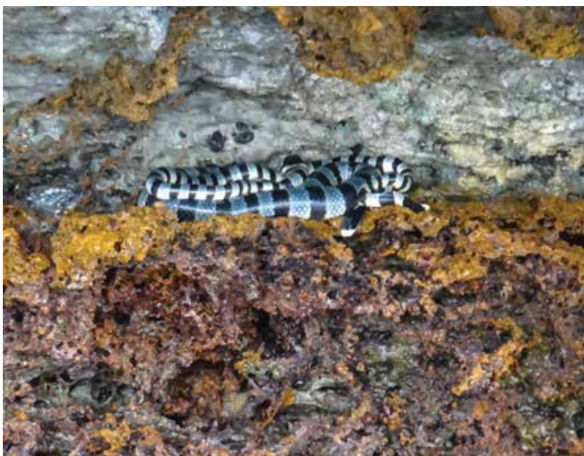
Two banded sea snakes rest entwined on a ledge above the water

At about 5:00 p.m. the wind starts to blow from the north. Around 7:00 p.m. it whistles and starts to rain. By 9:00 p.m. it is pouring and howling, heeling us to port. Jim checks the wind speed. It’s in the high 30s. How high will it go? There is nothing more