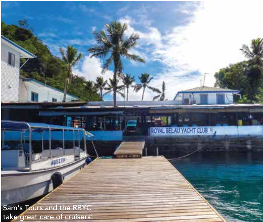
Sam's Tours and the RBYC take great care of cruisers

brings us to Cemetery Reef, a popular snorkeling spot. The place is lined with tour boats in the morning and afternoon but they break for lunch so that's when Jim and I go and have the reef to ourselves.