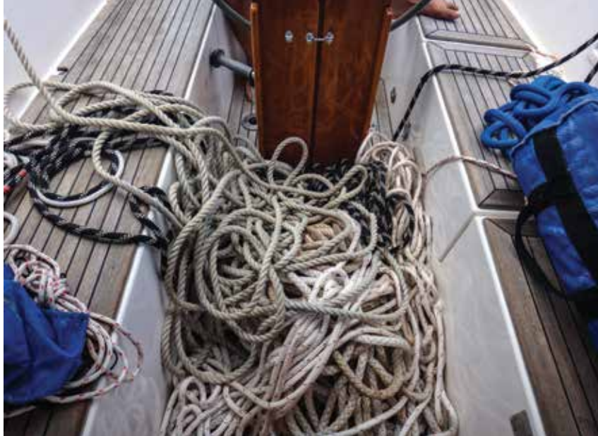
Hauling in all the lines once the typhoon passed