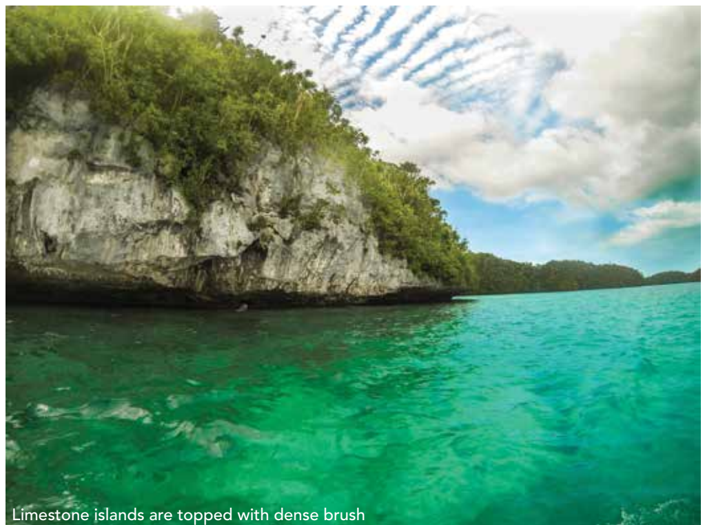
Limestone islands are topped with dense brush

The Rock Islands are a beautiful place to kayak. There are overhangs to paddle beneath at low water, caves to peer into, coral to gaze down upon and turtles to watch gliding by while tropicbirds, terns, noddies and bats soar overhead. A lovely mile and a half paddle from anchorage A420