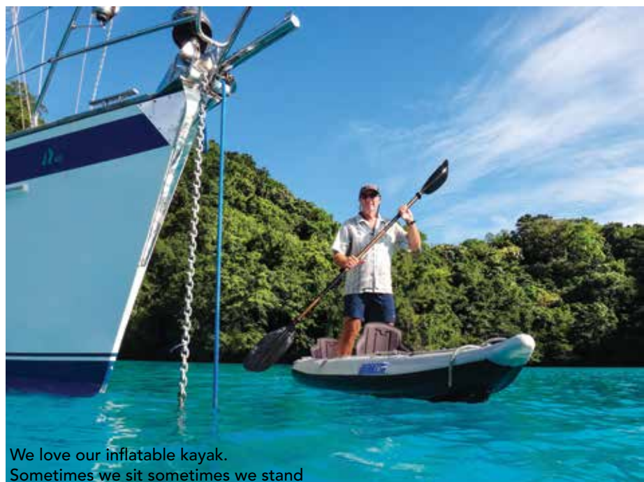
We love our inflatable kayak. Sometimes we sit sometimes we stand

Palau is a pristine dive location; one of the world's best. We dive Sias Corner which is a breathtaking wall with oodles of creatures. Two turtles, several reef sharks, a large Napoleon wrasse, an enormous colorful triggerfish and a moray eel are some of the highlights. We also dive Ulong Channel where we hook onto the reef and watch black-tip reef sharks swim by before releasing ourselves to slowly drift into the lagoon over coral, sponges and a plethora of fish.