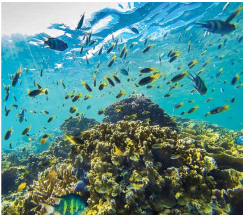
Above, Cemetery Reef; below, Arai Bai is a traditional meeting place for men in Palau