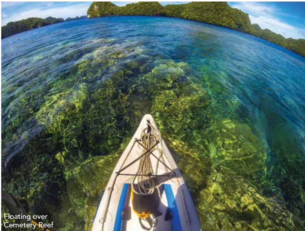
Floating over Cemetery Reef

surrounded—big ones, small ones, pulsating in and out, moving up and down, left and right. It is impossible not to brush up against them. We do not duck dive deep because the bottom is toxic. Scuba diving is not allowed.